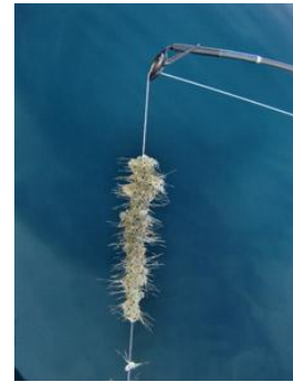
Picture 3. Mat of these water fleas on a fishing line