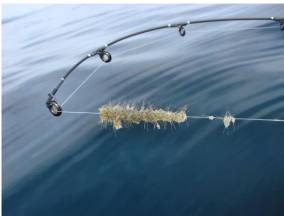
Picture 2. Mat of these water fleas on a fishing line

These small organisms are euryhaline and eurythermal organisms which mean that they can tolerate variations in both the salinity and the water temperature. However, these water fleas prefer brackish water (mix of fresh and saltwater). They feed on small organisms in suspension in the water (plankton).